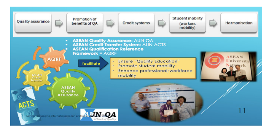
Figure 1. AUN Systems (N. Gajaseni, 2015).

plan, laboratory plan, teaching evaluation, laboratory evaluation and curriculum evaluation. All universities in Thailand have been enforced to be under the qualification framework since 2014. A university curriculum specific profession's should meet requirements in various industries such as medicine, engineering, accounting, law, etc. AUN-QA, ACTS and AQRF can facilitate ASEAN universities to ensure education, promote students mobility and enhance professional or workforce mobility.