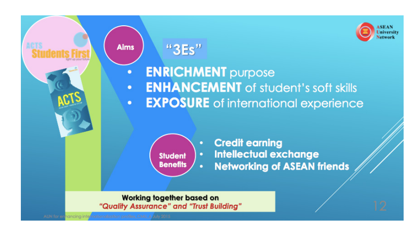
Figure 2. ASEAN Credit Transfer System Principle (N. Gajaseni, 2015)